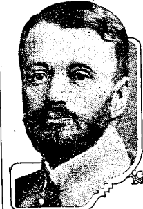
Count Julius Andrássy.

Count Julius Andrássy of Budapest, who according to news reports has just been in Berlin talking over peace prospects with German officials, sees no satisfaction to either of the contending sides as a result of the war. He is sure that both the Allies and the Austro-Germans will tenuously hold their ground, and that the war is bound to end in complete exhaustion to both sides unless it soon comes to an end.