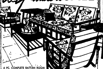
6 PC. COMPLETE RATTAN ROOM

6 pc. group includes Sofa, Lounge chair, "Sleepy Hollow" chair, 2 End, 1 Cocktail table. Philippine rattan in walnut... zippered, reversible 5" polyfoam cushions... resist everything, plastic top tables. Gold or Blue with White. Green with Orange.