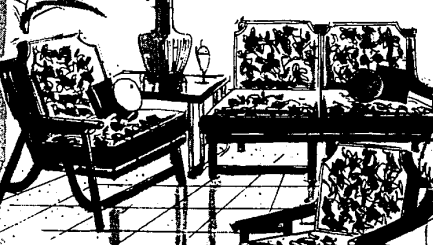
6 PC. "KONA KAI" PHILIPPINE RATTAN ROOM GROUPING AT SAVINGS

ALL GROUPINGS SHOWN AT MID-SUMMER SALE SAVINGS, IN STOCK FOR IMMEDIATE DELIVERY