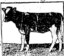
Purebred Holstein Calf.

Use purebred dairy sires from cows having large and profitable productions of milk and butterfat. Raise well the better calves from cows which for one or more genera-