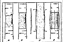
Details of Bridge Grafting.

Where Considerable Damage Has Been Done by Rabbits Gnawing Bark, Grafting is Required. In response to a query as to what was best to do for young pear and apple trees damaged by rabbits gnawing the bark, Rural New Yorker makes the following reply: Where the trees have been eaten entirely around, so that the trunk is completely girdled, nothing can be done except to bridge graft the tree. This means using scions of small limbs to connect the bark below the wound with that above it. Thus the injured area is braced by a number of scions, one end in the unjured part above and the other below the wound. This makes a connection between the live tissues. The sap is carried up through these scions. In time they unite like any other graft, and if properly cared for after some