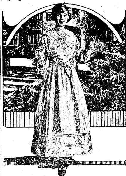
New Notes in Taffeta Frocks.

After a summer which has prevented an unending procession of taffeta frocks it takes courage on the part of a designer to introduce still another model. But the pretty afternoon gown shown is assured of favor because of its suggestion of quiet, Quaker style. Summer waif frocks have included so much in the way of gay and colorful clothes that a demure gown like this strikes a new note.