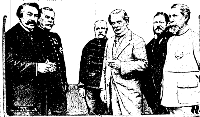
Left to right: Aristide Briand, French premier; General Joffre, General de Castelnau, chief of the French general staff; Lloyd George, Great Britain's minister of war; M. Thomas, French minister of munitions; and General Haig, French minister of war. This gathering of the greatest of France's war chiefs and Lloyd George, Britain's minister of war, is one of the most notable conferences that have taken place since the beginning of the great war.