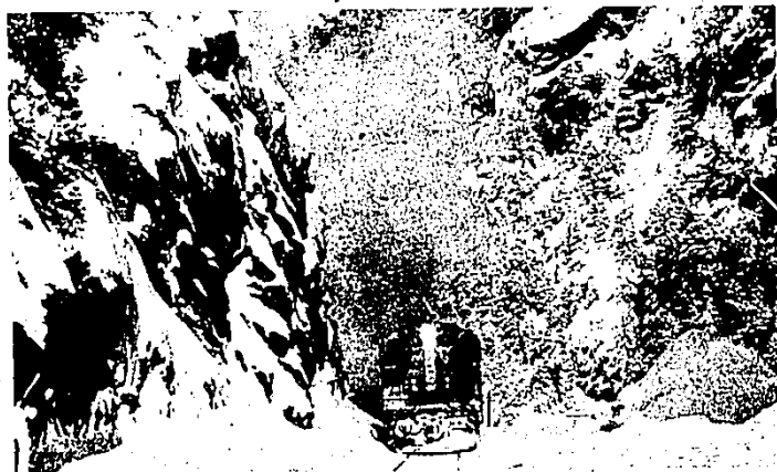
THE MAJESTY of the Canadian countryside is captured on a snow train journey.