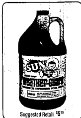
Suggested Retail $5.99