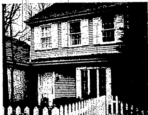
NEW COMMUNITY has won an environmental honor award for respecting the natural state of the wooded site.

WE WILL BE CLOSED THURSDAY, SEPT. 27 FRIDAY, SEPT. 28 FOR OUR HIGH HOLIDAY. WE WILL BE OPEN SATURDAY AS USUAL TO SERVE YOU.