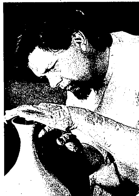
SIXTY PAINTERS, potters and sculptors will make and sell their art in "Peoples of the World and Their Art" in Westland Center, Warren and Wayne Rds., Oct. 17-21. Show hours are 9 a.m. to 9 p.m.

The chamber-size orchestra is in rehearsal for its first concert of the year, Oct. 26 at 8 p.m. in Varner Recital Hall.