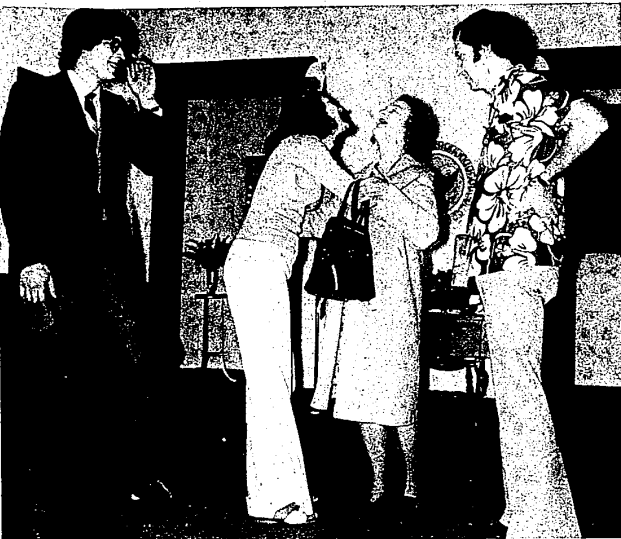
A BENEFIT PERFORMANCE of "Don't Drink the Water" will be given at 8 p.m., Nov. 15 at the Farmington Players' Barn. The $6 donation, which includes a champagne after-glo, will be used to benefit the Farmington Com-