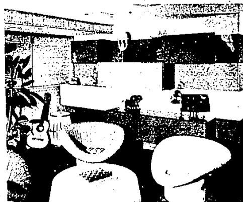
COLORFUL ACCENT WALL made of prefinished hardboard paneling camouflages the storage cabinets in a downstairs recreation room.

tural load, the wall offers big pockets for oversize medicine and storage cabinets in the powder room.