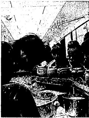
PATRONS OF THE ARTS watch as an artist works in the Artrain, a four-car train that houses outstanding art exhibits, scheduled to visit Livonia in March.