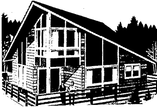
MODIFIED A FRAME second home accommodates leisure or year-around living with 1,076 square feet of floor space, two bedrooms, kitchen, laundry, wrap-around deck.