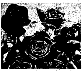
VIVA'S 2½ to three-inch blooms are bright red, starting as deep red one-inch buds. The plant is four to 4½ feet high and has glossy, medium green leaves.