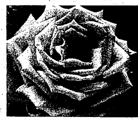
SUNFIRE is aptly named. The high-centered blooms are deep orange, a more striking color than either Tropicana or Zorina, its parents. The buds are ½ to ¾-inch, opening to three-inch blooms. Plant height is four feet. Foliage is light green.