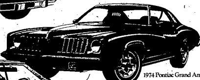
1974 Pontiac Grand Am.