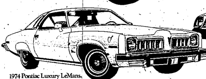
1974 Pontiac Luxury LeMans.