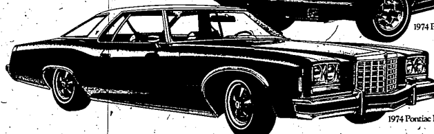
1974 Pontiac Bonneville.