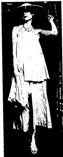
'New' strapless look

Super Labor Saver 2 Weeks Only March 4 Thru March 16