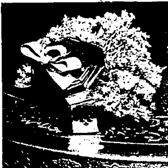
A FLORAL CRICKET BOX

Whatever the item time consideration remains the key factor.