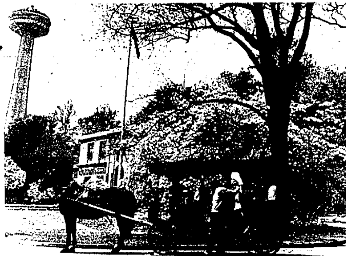
A DIFFERENT HONEYMOON VIEW OF NIAGARA FALLS

honeymoons would last one week. But at least one area couple decided not to take a honeymoon at all.