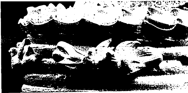
SWEET LOVEY DOVES