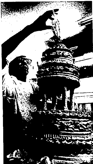
THE FINISHING TOUCH

CAKES AT THE Inn are made "with real butter and eggs."