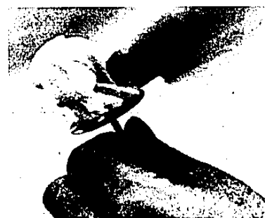
MAKING A ROSETTE