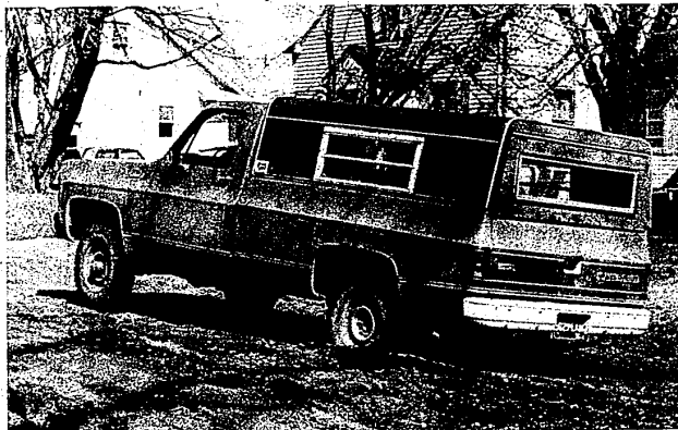
GILL ROAD The road which serves two schools is nearly impassable.

WE STRIP CHAIRS - DOORS CABINETS - HUTCHES & TABLES Call SUNSHINE STRIPPING CO. 839-1766 8 MILE AND HOOVER, DETROIT