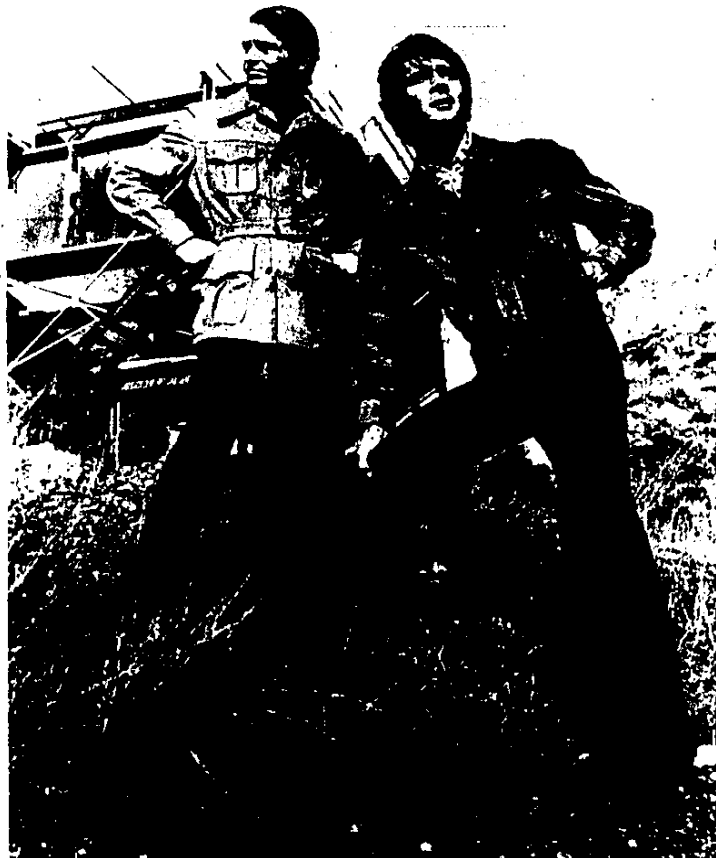
Suede swings into spring in safari looks or baseball jacket revisions by Bert Paley, Ltd.

In every case, jackets have plenty of pockets, just in case all those necessary items won't squeeze into close-fitting trousers.