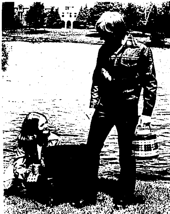
Picnic clothes that are real jeans

OPEN DAILY 9:30 TO 6; THURSDAY, FRIDAY TO 9; SUNDAY 11 TO 5