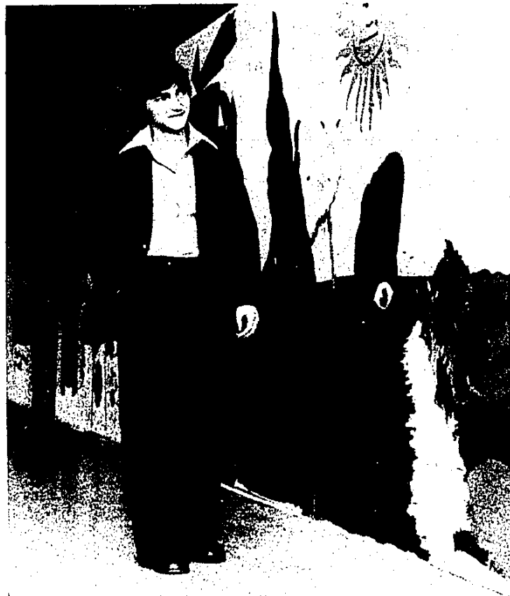
Rafael's dressy denim

WALKER'S is the first in Michigan to SAVE YOU 40% AND MORE ON NATIONALLY- ADVERTISED MEN'S CLOTHING