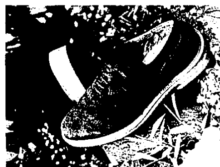
Classic wingtip in suede with crepe soles