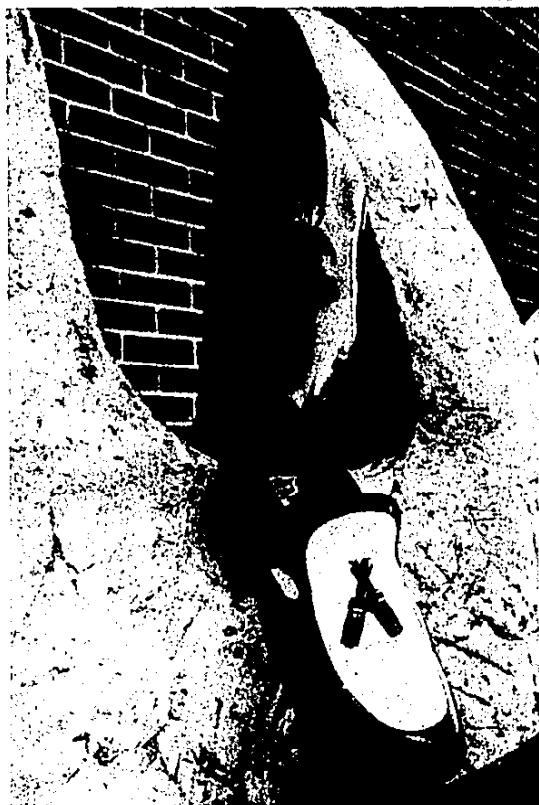
Rounded toes and the brogue tassels in patent for spring

Fashion forecasts advise that being with only one shoe, and a black one at that, is really not the vogue unless you're absent-minded or in an extreme hurry.