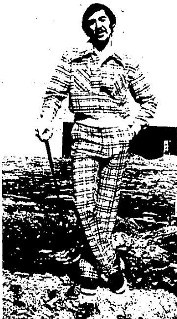
A 'new' Gatsby golf suit

These suits should be worn with as much casualness—freedom—as one can muster. Open necked shirts whose collars are meant to overlap the jacket's collar, are a must. Turtleneck sweaters look especially good with the shorter cropped jackets.