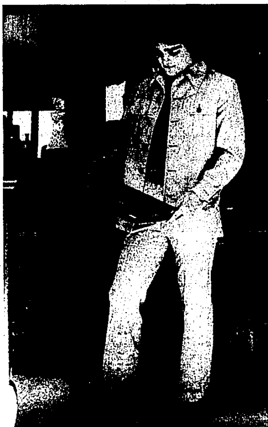
Grasscloth texture in a walking suit