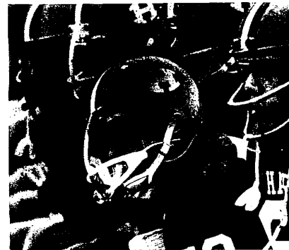
Harrison — looking for a Western Six Football title

Harrison plays Walled Lake Western (1-3 overall) on Friday (Oct. 11) at 8 p.m. on Walled Lake Central's field.