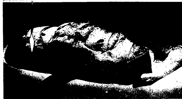
Sam Krinsky baked a 20 pound loaf of bread to celebrate the "Day of Bread" Oct. 8 and National Harvest Week Oct. 6-12

1 oz. yeast 2 tsp. salt 4 tsp. sugar 2 eggs 1/2 stick oleo 8 cups water 3 lbs. bread flour Dissolve yeast in half cup of water. Beat eggs, dissolve oleo and add oleo and yeast. Sift salt, sugar and all but one cup of flour. Gradually add flour mixture to egg. Turn bread out on a board and knead. Work in last cup of flour. Cover bread and keep in warm place until it rises to double its size. Punch down, knead again and let bread rise again. Punch down again and shape into four loaves. Put in buttered pans and let rise until one inch above pan. Bake at 375 for 35 minutes.