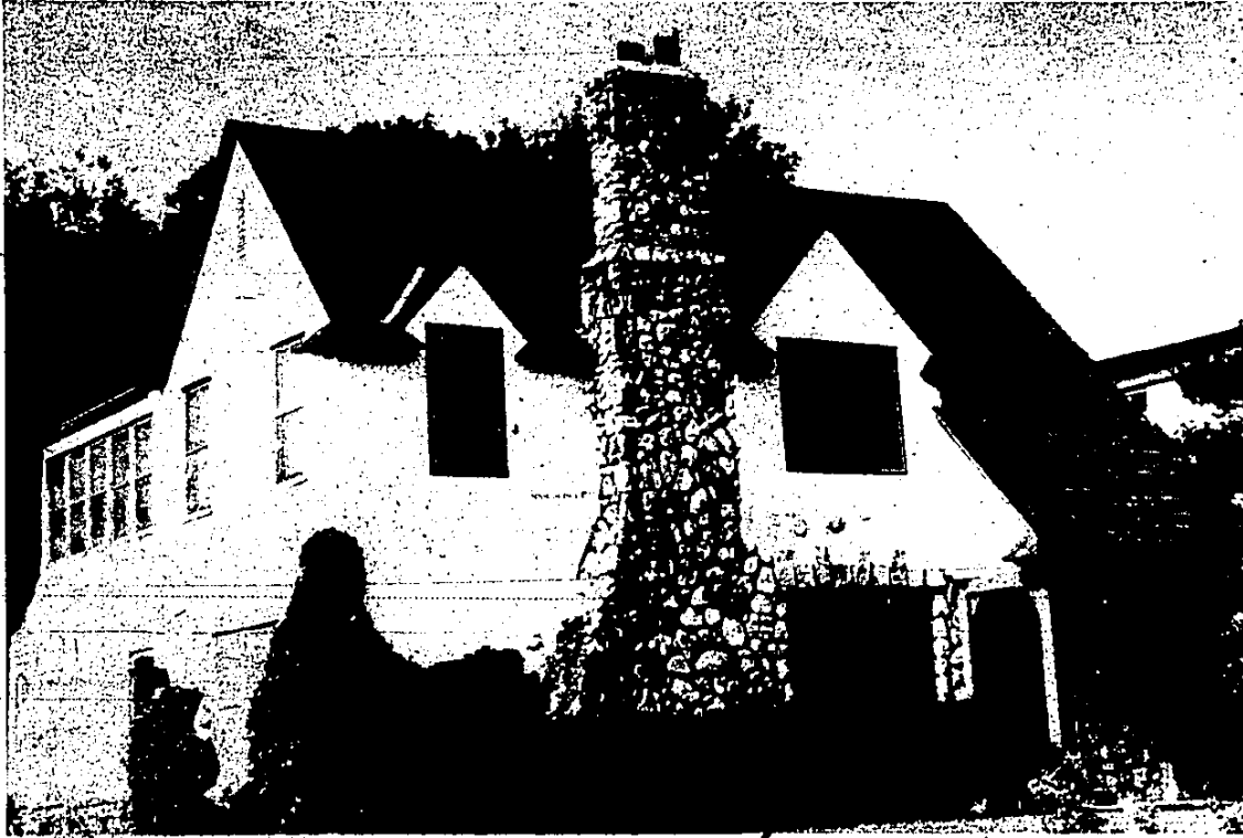
A classic American roof in modern materials