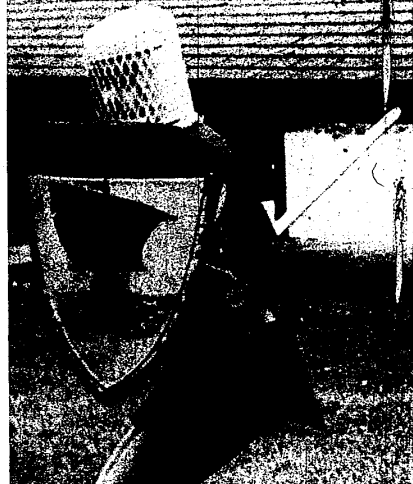
Tyson-Lang (Craig Fleischer) in combat dress.