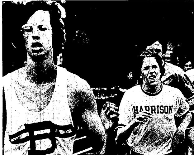
The Harrison runner's pained expression could reflect his team's showing in the Western Six track meet last week. The Hawks had seven points and finished last.