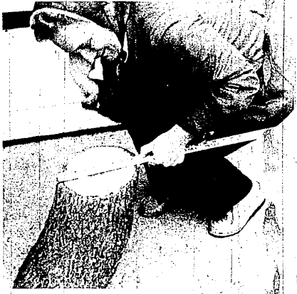
The trees were good-sized.