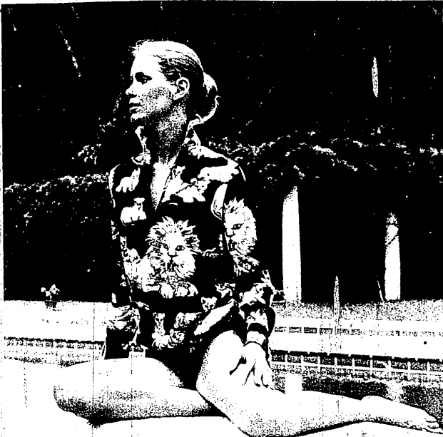
Animals prints roar with color and contrast.

Bold bright colors, in combinations of green, orange and yellow; or blue, green and red, do the story-telling. Designed in everything from eveningwear to beachwear, the prints can liven the under-the-sun wardrobes of men and women.