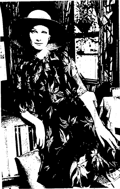
Filmy prints make a dramatic entrance this season.