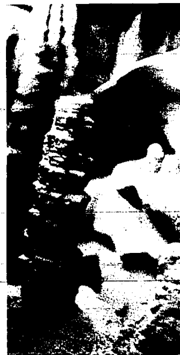
A stalagmite in a Kentucky cave

Steeped in military history the state abounds with monuments to battles and heroes. Among them is a monument to Jefferson Davis which is a replica of the Washington Monument in Washington, D.C.