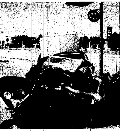
A view of the car that collided with a boulder

Patterson asked the administrators to critique the handbook and the symposium for its contents and value to them. A second symposium is planned sometime in the fall.