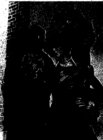
Ruffini for NIK-NIK bolsters the back