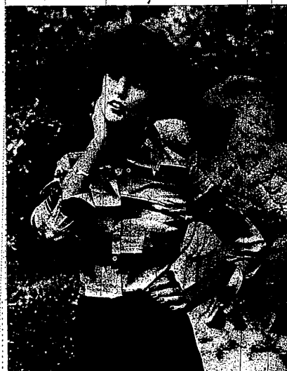
Shirt dressing is reaching new horizons