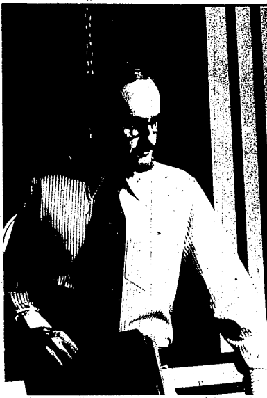
THE BOARDROOM Exclusively in Somerset Mall.

Fine quality, long sleeve dress shirts by some of our best makers and designers. There's a handsome assortment of stripes, plaids and solid shades, all in pure cotton, with spread collar, button cuffs. Collar sizes 14 1/2 to 17, sleeve lengths 32 to 35.