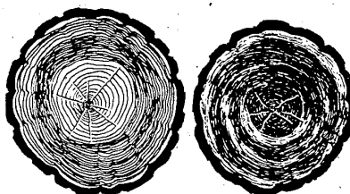
52-year-old tree from managed forest

Mulch or cultivate to control weeds. "Fertilization now gives the rhubarb a head start on storing food in its roots to carry it through winter," Herner says. "It also increases chances of a good crop next summer."