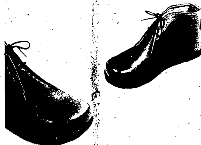
Over-the ankle boot goes with sport clothes, pants in black, brown or white