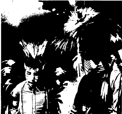
Indians perform dance

Mango records, and you may have trouble digging that one up. The rhythms aside, reggae's most noticeable difference from American blues is its optimism as infectious as the beat.