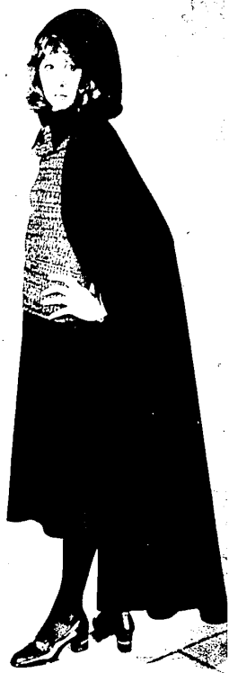
Hooded cape adds drama to vested skirt ensemble in Klein collection.