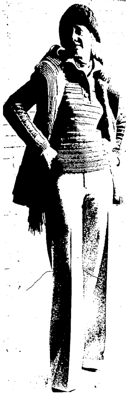
Klein's fur-lined sweater jacket tops trouser and sweater outfit.