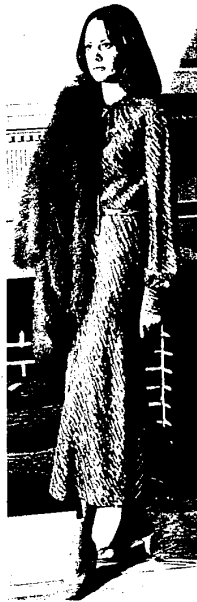
Flame mirabeau jacket is Dior's cover-up for gold-flecked evening look.

The big look interpreted into a collection of coordinated separates is a strong statement from Dior for the fall.