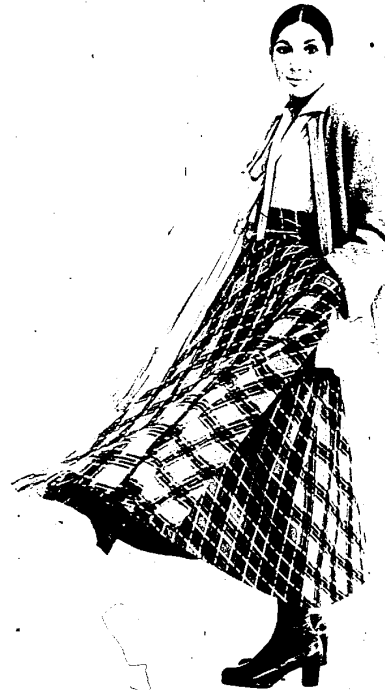
The sweater jacketed big skirt ensemble from Dior.

The emphasis on the "big mood" is reiterated in accessorizing touches. Waistlines are defined by wide waistbands. Long fringed scarves wrap throats. Oversize feather boa trim tickles the chin from a cape collar.