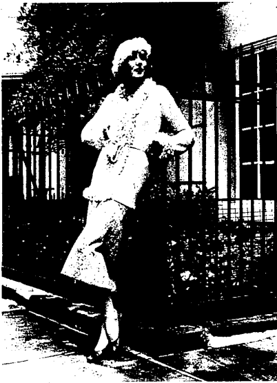
Marc Bohan designs the long cardigan and knee-covering skirt for Dior.