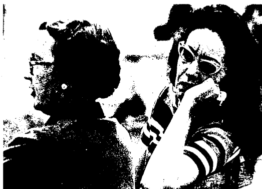
Hot sun and hard pavement add up to a rough day for this visitor