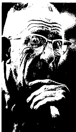
You're never too old for the fair