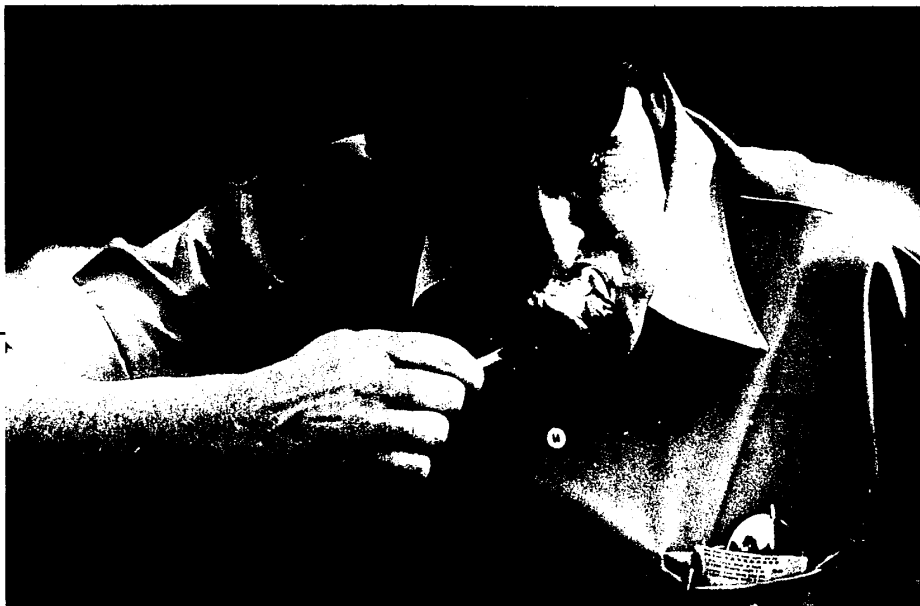
One candy-apple vendor samples his own wares