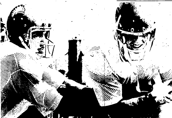
The wishbone's first option involves the quarterback handing off to the fullback off tackle.

"This team has an excellent attitude. It's up to par with any team I've ever coached. Motivation is perhaps 90 percent of this game and this year.