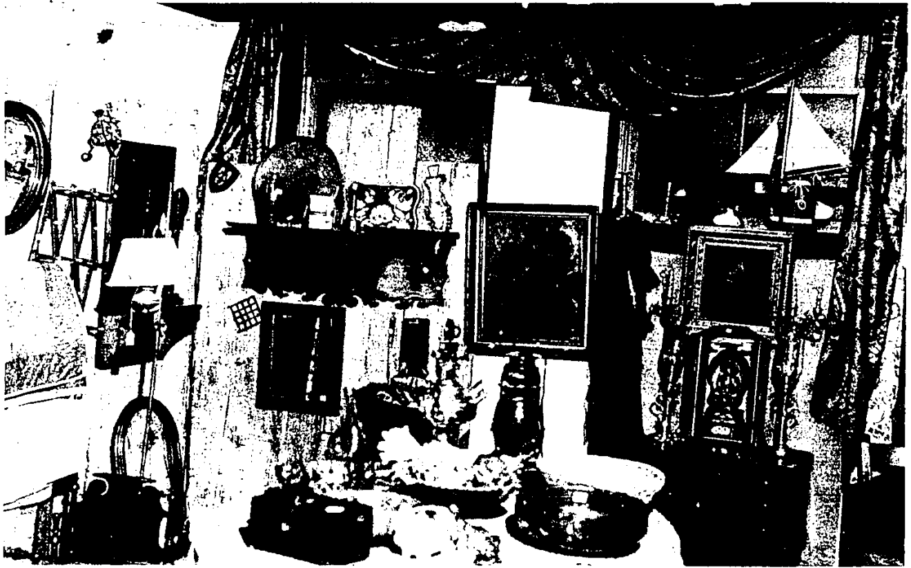
OLD QUILTS, crockery, tinware, wrought iron, decoys and woodware abound at the Plymouth Symphony League's Antique Mart. Elegant old jewelry, china, glass and furniture also are

available at the three-day show in the Cultural Center on Farmer Street.