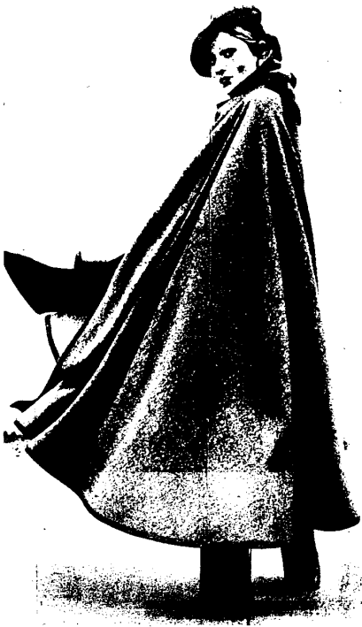
Bill and Hazel Haire design the cape in rust tones with suede trim