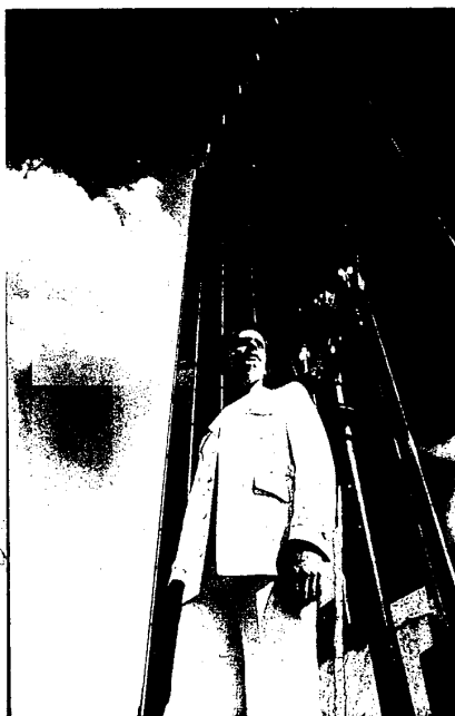
Pierre Cardin designs bright white with detailing

And so he designs, catering to a specialized customer who wants to look and feel good in the clothes he wears.