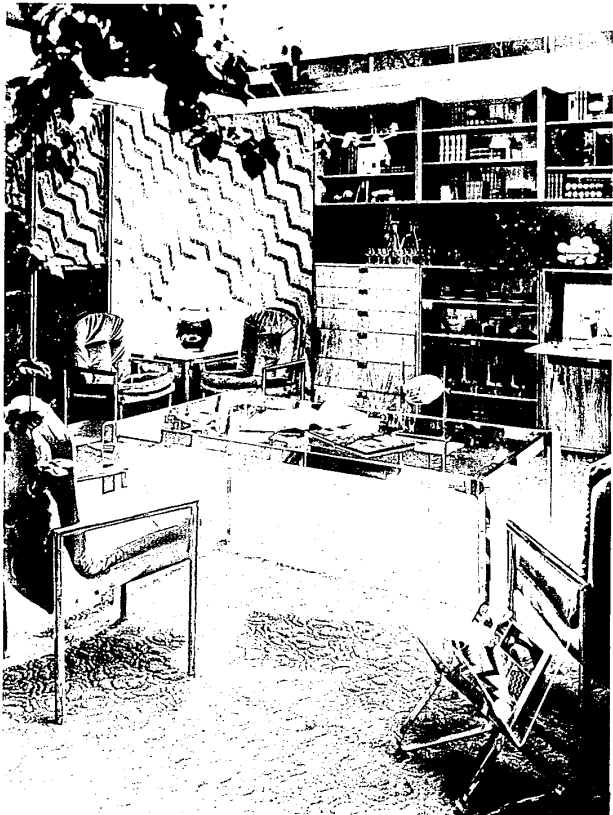
ROOM WITH MANY uses—dining room, study area, den etc.—can be executed by anyone who has a space squeeze. All that is

required is organization and planning plus some functional wall systems and adaptable furniture.