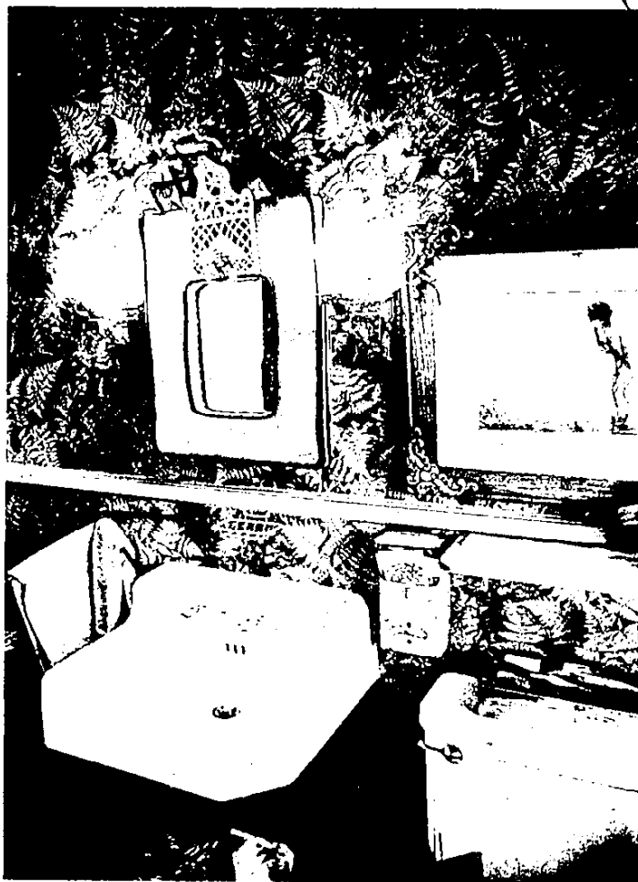
Wrapping paper provided the 3-D fern effect

Look for small art collections inside those cloisters, too.