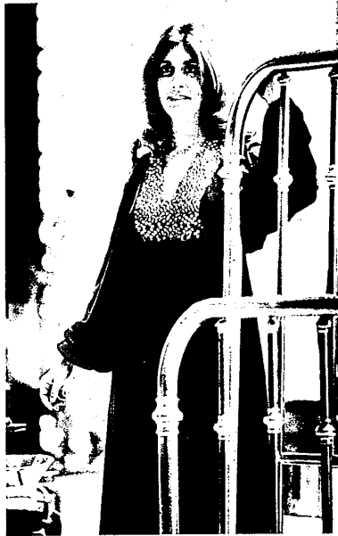
Maternity fashions are becoming elegant at night

"Hopefully a woman will control her diet," he said. "We allow for normal growth by subtly building in extra fabric. A woman can look good throughout her pregnancy, up until the ninth month. Then it's very rare when a woman looks really good, they usually start to retire then."