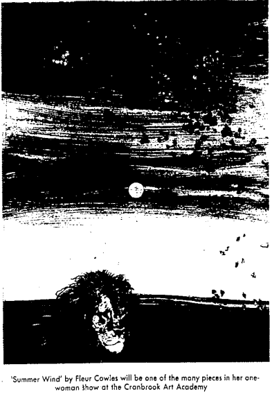
'Summer Wind' by Fleur Cowles will be one of the many pieces in her one-woman show at the Cranbrook Art Academy